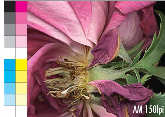
Figure 2. 150lpi AM - Reference image