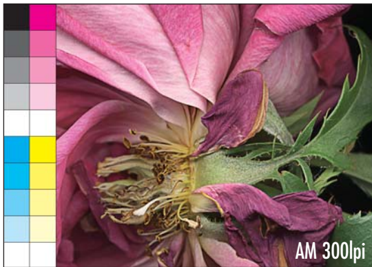
Before (without curve)